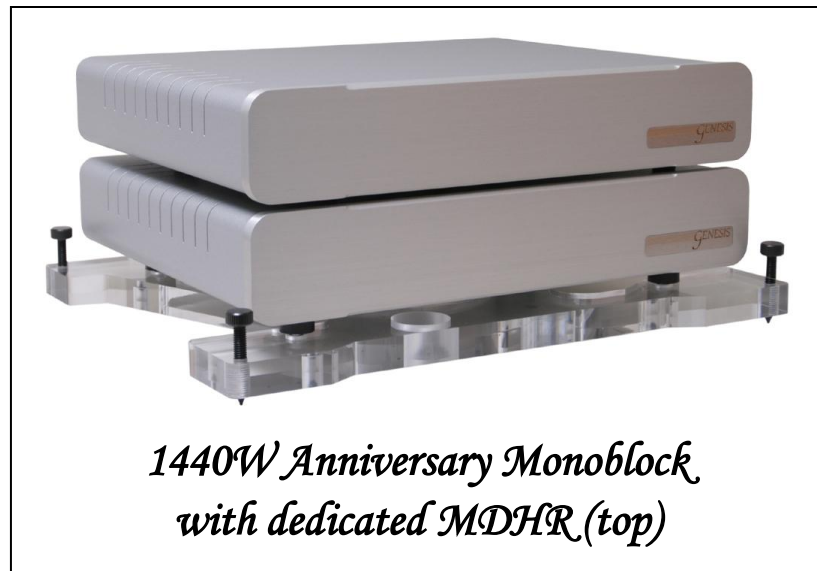
1440W Anniversary Monoblock with dedicated MDHR (top)

The ultimate expression of the Genesis Reference Amplifiers is the Anniversary Monoblock – released to celebrate the 10 th Anniversary of Genesis Advanced Technologies. Capable of delivering up to 1440W into a pair of Genesis loudspeakers, and with an optional dedicated MDHR specially tuned for monoblock operation, the Anniversary Monoblocks + Anniversary MDHR is set to take musical amplification to the next level and beyond.