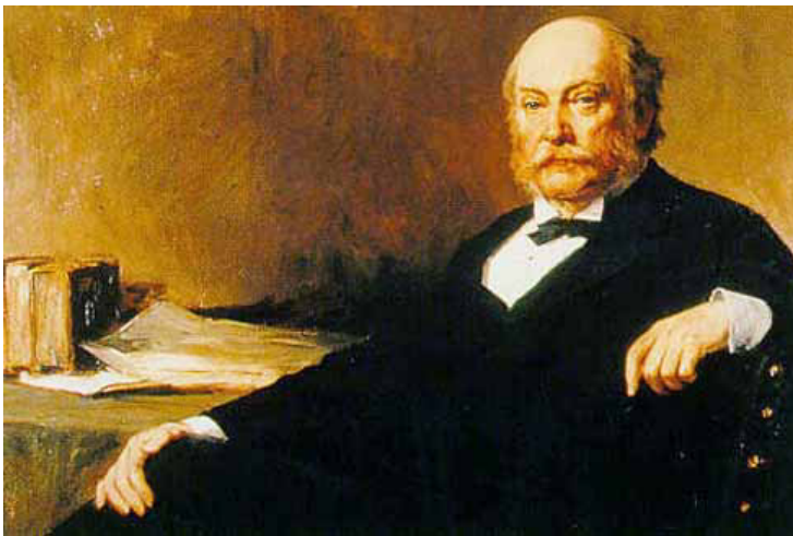
John William Strutt, Lord Rayleigh (1842 – 1919)

Nothing has changed in theoretical acoustics since Lord Rayleigh’s original book on acoustics published in 1877. There are still only two proper ways for a loudspeaker to propagate sound in a room: a point source and a line source. Anything else, or everything in between, is a compromise.