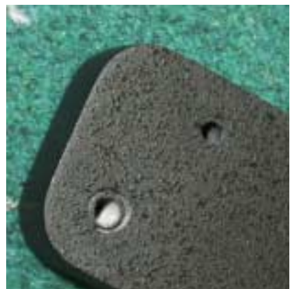
This side faces up

However, what is important is to identify the top and bottom, and the front and back of the frame. Look at the holes at each corner of the frame. The top and bottom of the frame is different as illustrated in the two pictures below. There is a recess for the washer and bolt-