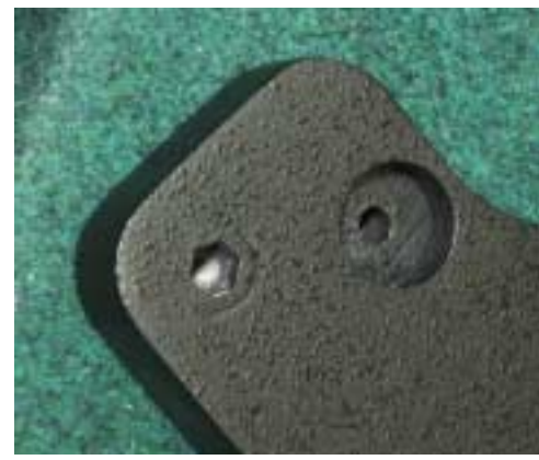
This side faces down

head on the bottom face of the suspension frame.